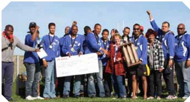
Hawston was the 2012 Cricket Champions