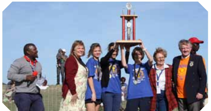
Hermanus was the 2012 Netball Champions