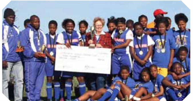
Siyadlala was the 2012 Ladies Soccer Champions