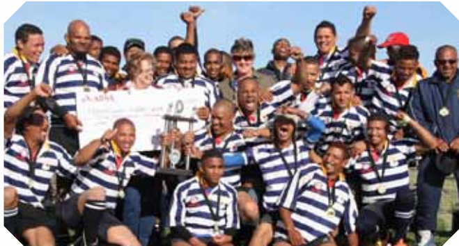
Kleinmond won the 2012 Mayoral Cup